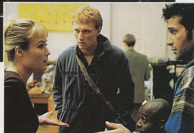
Scary moment! Leo's ex-girlfriend meets his new boyfriend in Bedrooms and Hallways